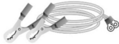
Battery clip cable

(The above picture just for reference ,may have a little difference from the real products)